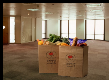
OPERATION FOOD SEARCH RECYCLING PROGRAM