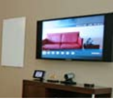
video conferencing capabilities