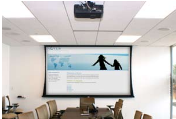
dual presentation functionality

NOVUS International, Inc., a leader in animal health and nutrition serves more than 2000 nutritionist, producer and veterinarian customers in more than 90 countries. NOVUS is a leading developer of animal health and nutrition products and programs for the poultry, pork, beef, dairy, aquaculture and companion animal industries.